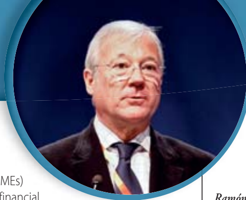
Ramón Luis Valcárcel Siso, President of the Committee of the Regions, Chair of the CoR Jury

We must therefore continue to inspire Europe's cities and regions to unlock their entrepreneurial potential which will in turn help to mitigate the effects of the crisis and contribute to achieving the Europe 2020 goals on the ground.